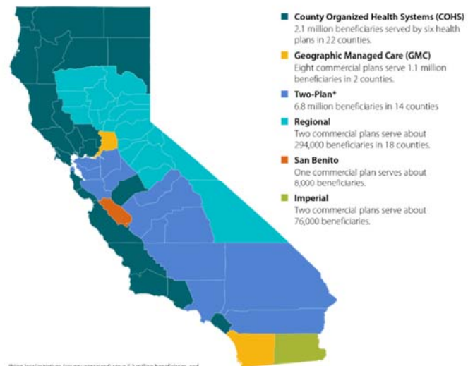
Managed Care Models, by County, December 2018

*Nine local initiatives (county-organized) serve 5.2 million beneficiaries, and three commercial plans serve 1.6 million beneficiaries. While Tuolumne is a two-plan model county, there is no local initiative and instead, beneficiaries choose between two commercial plans. Sources: Medi-Cal Managed Care Program Fact Sheet – Managed Care Models, California Dept. of Health Care Services (DHCS), n.d., www.dhcs.ca.gov ; and Medi-Cal Managed Care Enrollment Report – December 2018, DHCS, January 2, 2019, www.dhcs.ca.gov .